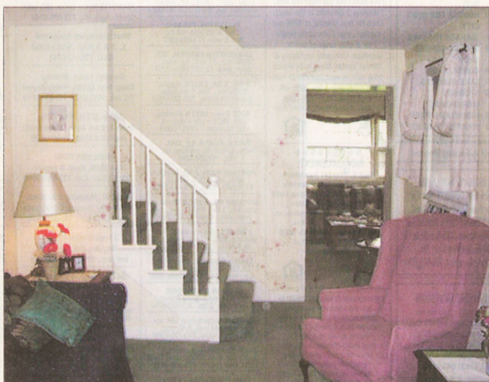
Front room in need of help: Narrow and uninviting.