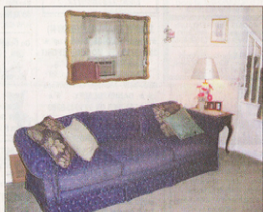
ABOVE: This couch should be replaced with a slightly curved sofa that compliments the shape and fabric of a reading chair. LEFT: These chairs should be replaced with a comfortable chair and ottoman.